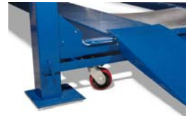
Optional Caster Kit