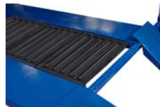
Optional Drip Trays