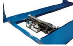
Optional RJ-45 Bridge Jack