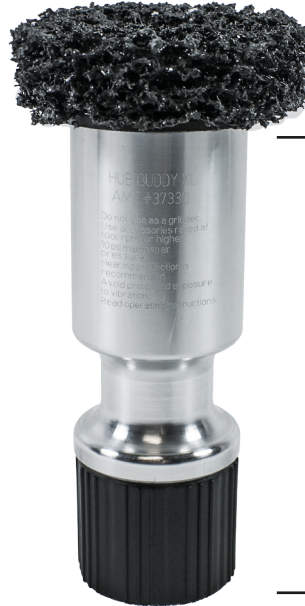
1/2" Drive Socket