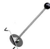
Steering Wheel Holder 74A010478