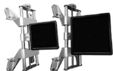
HD Targets Front: EWAC03-01H Rear: EWAC03-02H