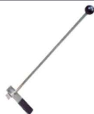
Brake Pedal Depressor 74A010479