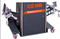
Mobile Trolley 46DW026402