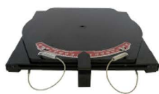
Turn Plates 1300025140P