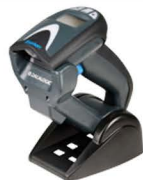
Vin Code Scanner GBT4430