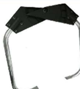
Rim Width Gauge 940051000