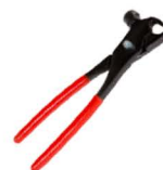
Weight Hammer 301400525