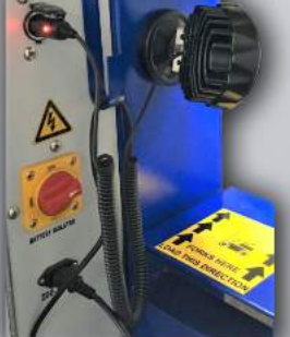
New! LED Light with Magnetic Base!!