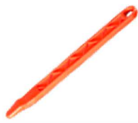
Plastic Lever Z4-602261