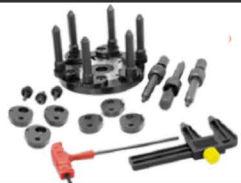
ULS Universal Locking Flange Z3013240