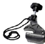
Hand Free Clamp 0604065