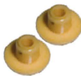
Lock Handle Protection Z461560