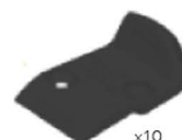
Leverless Head Front Insert Z8-11600367