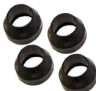
Cone D.58 Z4-118294