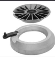
VR Fixing Accessory Kit Z8-11100086