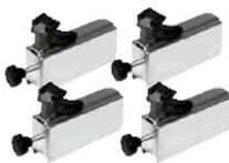
Clamp Extensions 100012100