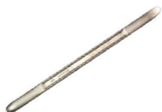
Bead Lifting Lever 511242