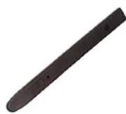
Bead Lifting Lever Cover C00A000017