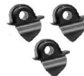
Front Insert Z63905900