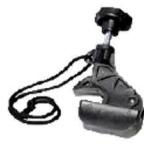
Hand Free Clamp 0604065