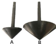
Centering Cones A: Z067901600 B: Z3-90295