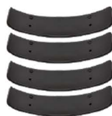
Bead Breaker Cover Z456887A