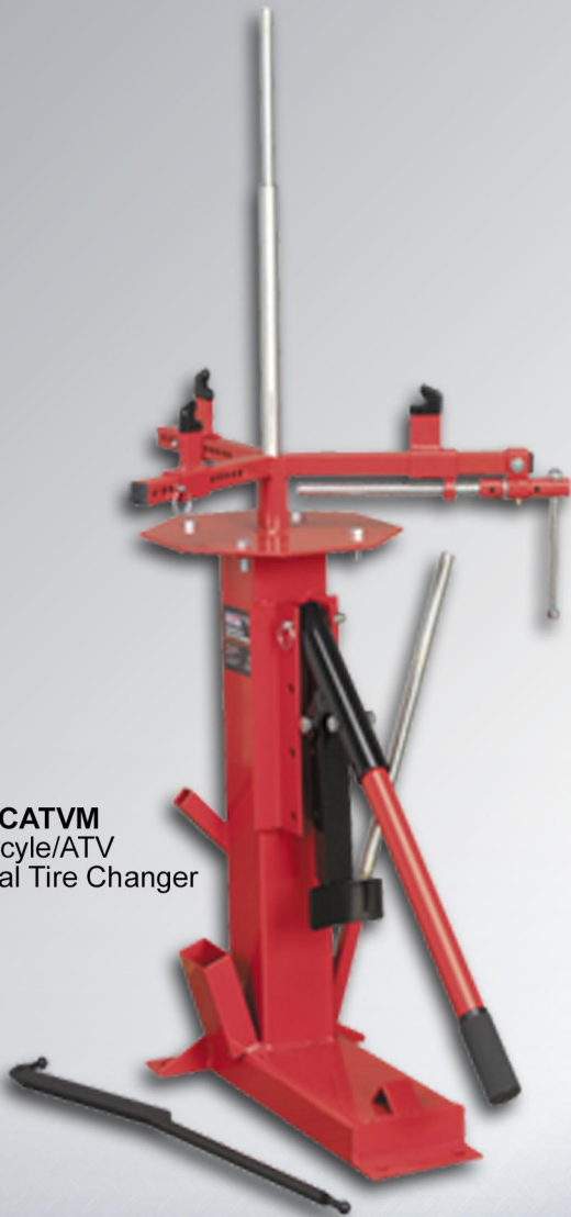
TC-MCATVM Motorcycle/ATV Manual Tire Changer