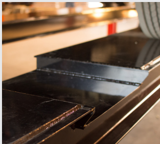
ALIGNMENT AND FLAT DECK AVAILABLE