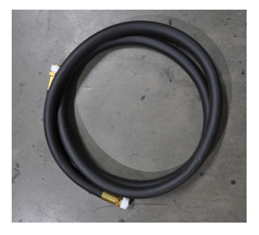
Step 3. Apply teflon tape to both ends of 1.8 m 1/2 outlet hose.