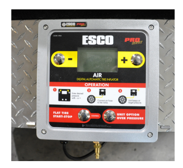
Step 1. Begin with unit powered off.