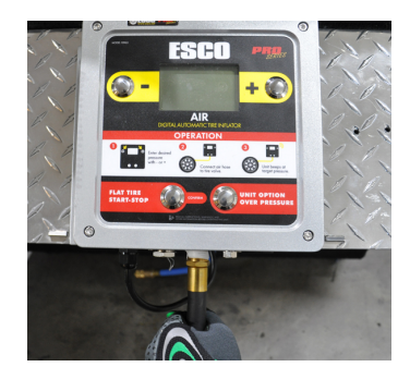
Step 3. Connect 1/2" outlet hose assembly directly to inflator air outlet.