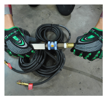
Step 4. Connect the other end of outlet hose to the air pressure release valve.