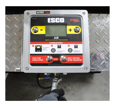
Step 2. Remove 1/4" outlet plug.