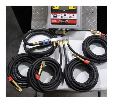
Completed 4-hose manifold assembly.