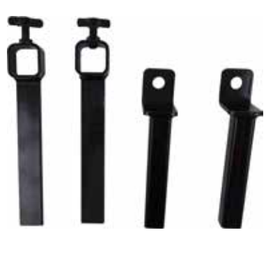
MODEL 70163 For 24" Through 29"