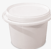
1970995 5kg Lube Bucket