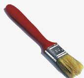
EAA0304G16A Lube Brush