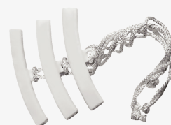
EAA0304G52A Plastic Rim Protector