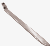
EAC0097G47A Wave Lever