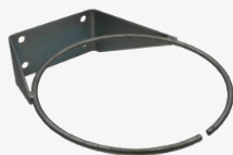
4025460 5kg Lube Bucket Holder