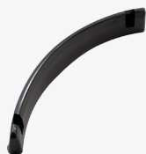
EAA0304G15A Bead Breaker Sleeve