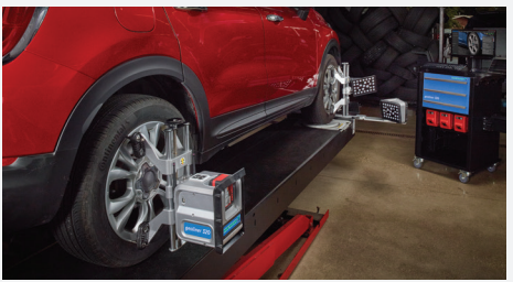
Small footprint makes the most of any available space, bringing advanced, intuitive alignment services to shops of every size.