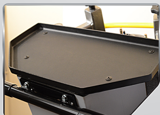
Tool Storage Tray