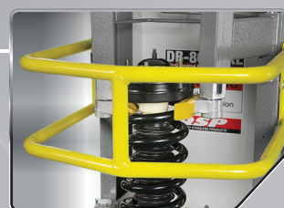
Drop Down Front Safety Guard