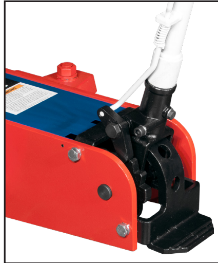
FASTJACK® mechanism raises the jack's lifting saddle to the load in one pump stroke.

Heavy duty truck, heavy construction and agricultural equipment maintenance garages