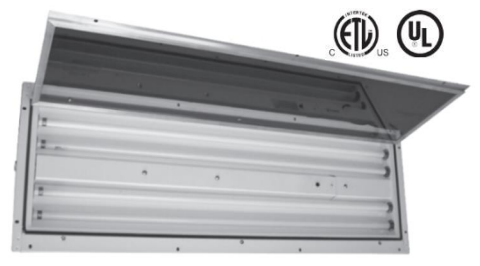
Superior Lighting, Industrial Light Fixtures with Inside Access Hinged Glass Door