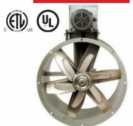
High Quality 12" Tube-Axial Exhaust Fan w/ Spark Resistant Blades