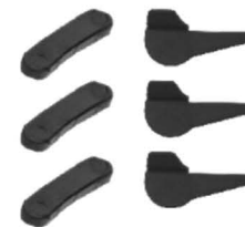
Rear Inserts YC13013650 Front Inserts YC13006689