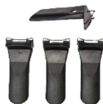
Clamp Cover YC130001468