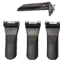
Clamp Cover YC130001468