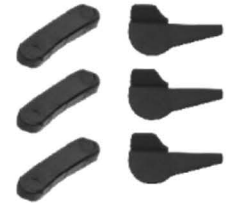
Rear Inserts YC13013650 Front Inserts YC13006689