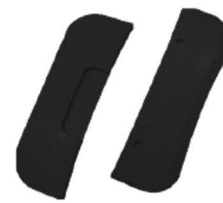
Bead Breaker Cover YC13013240