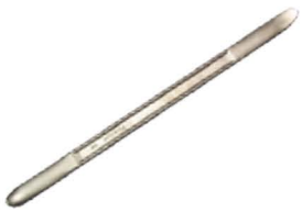
Bead Lifting Lever 511242