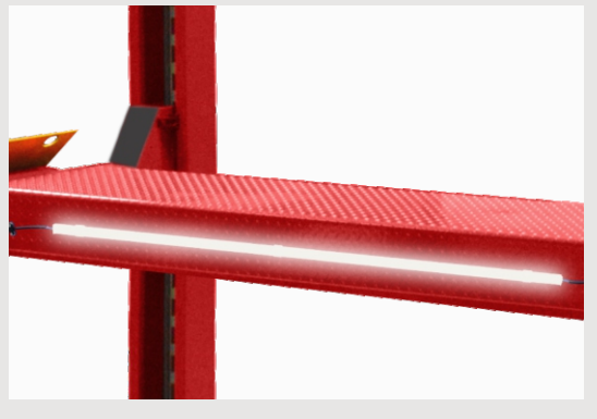
Optional LED lighting. Kits No.: 40103