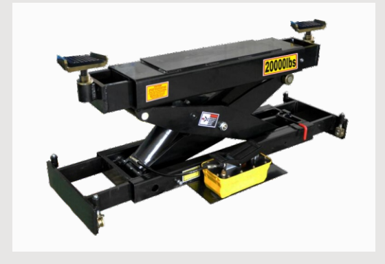
Optional Rolling Jacks: RJ-20A 20,000lbs