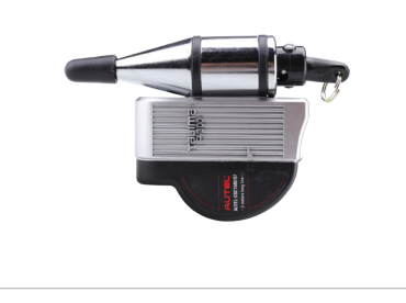
PLUMB BOB CSC1500-07