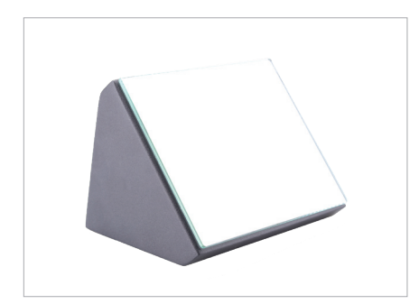
LASER ASSIST MIRROR CSC1500-06