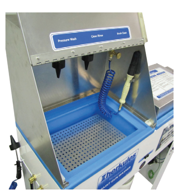
G520 manual cleaning tank