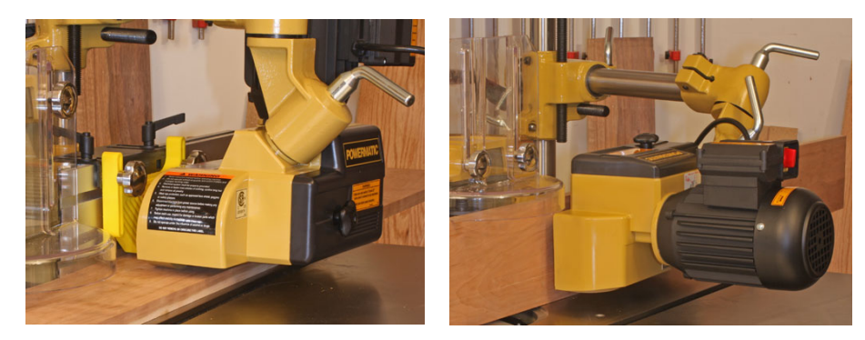
The articulated arms and universal joints allow using the Powermatic PF3-JR feeder to move stock flat on the table (left) or on edge at the shaper (right) for molding or face cuts.

POWERMATIC PF3-JR Stock Feeder out of the way when not in use. The roller wheels can also be positioned on the horizontal plane (to the table surface) for operations such as feeding stock on edge along a shaper fence for face cuts.