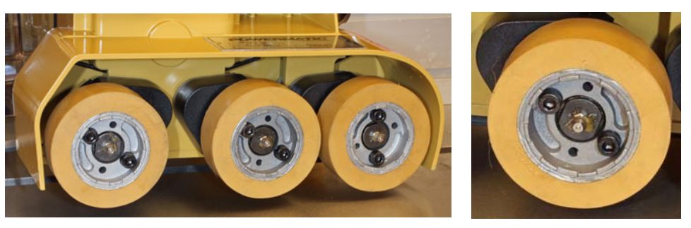
The roller wheels have specially formulated rubber tires (left) that grip well without marring the wood. Each wheel can be easily replaced individually. Each also has its own grease fitting (right) to keep maintenance simple.

quickly. To help contain costs the wheels can be changed individually if needed rather than in full sets. For specialty operations such as curved workpieces, the center wheel can be removed to