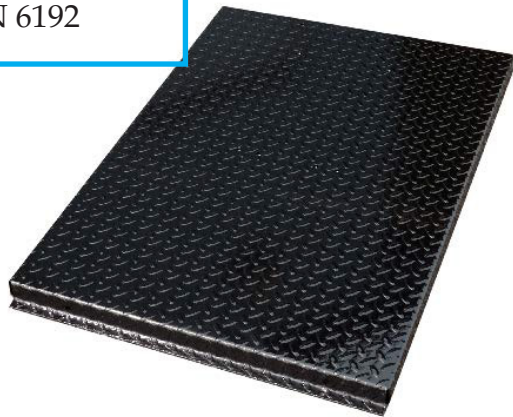
Optional Floor Plate PN 6192

The optional CH-22 comes complete with the fully adjustable rim clamps and 2 center posts to accommodate open hub and bearing wheels. It is easily mounted on the top of the CH-23 Stand.