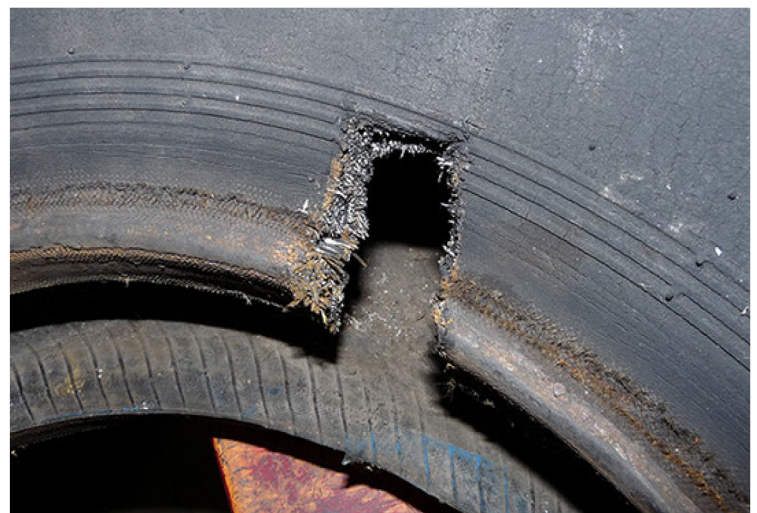
Detail of Notched Tire