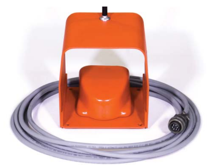
Hydraulic Accessory Tool Foot Pedal