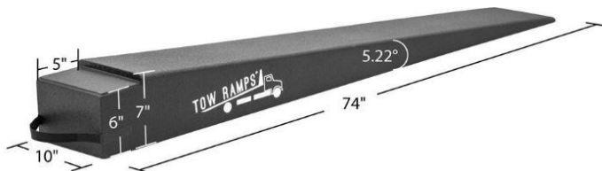
BT-TT-7-10 (1-pc model)