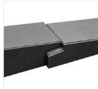
BT-TT-7-10-2 (2-pc model) Same dimensions as 1-pc model