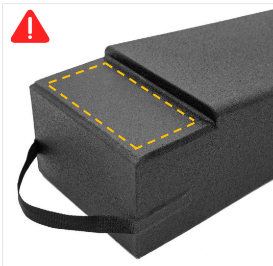
Fig. 1: Gently lower the flatbed/trailer bed and place on the Tow Ramp notch.