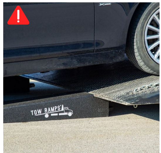
Fig. 2: Be careful to properly position the flatbed/trailer bed on the notch. DO NOT USE EXCESSIVE FORCE.