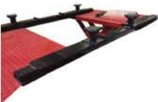
Adjustable frame engaging truck adapter