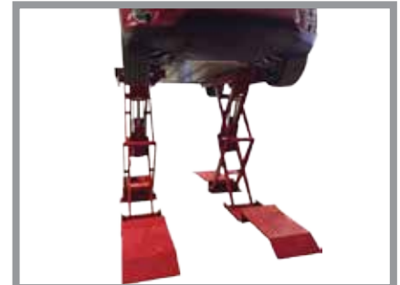
▲ Retractable Pull Decks 82.7" / 2100mm