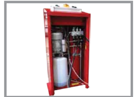
▲ Volumetric Control