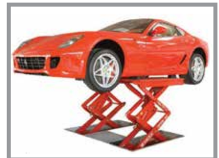
▲ Flush or Surface Mounted