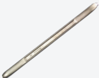
Bead Lifting Lever Cover